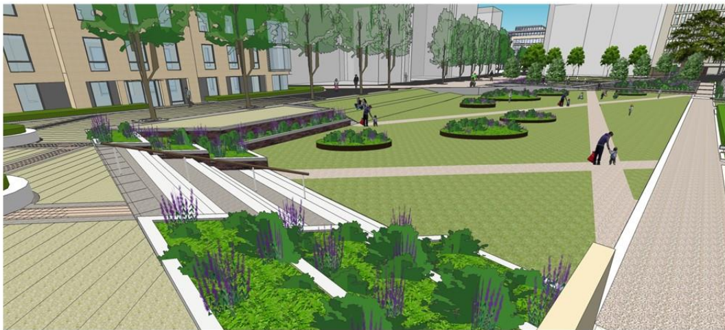
View looking North across Mill Park

CB1 New city quarter Cambridge see the future, be part of it