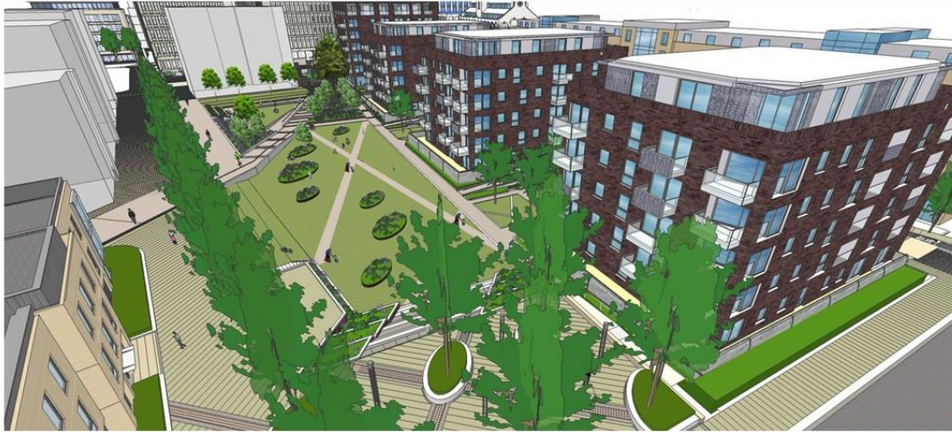
Aerial view looking North across Mill Park

CB1 New city quarter Cambridge see the future, be part of it